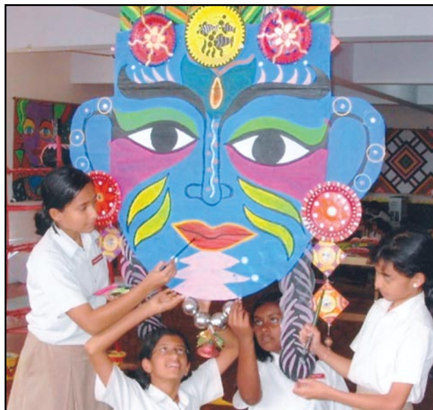
Students of National Public School, Bangalore giving final touches to the mask prepared by recycling waste

which in turn sends them to various schools which are unable to generate their own teaching aids due to economic constraints.