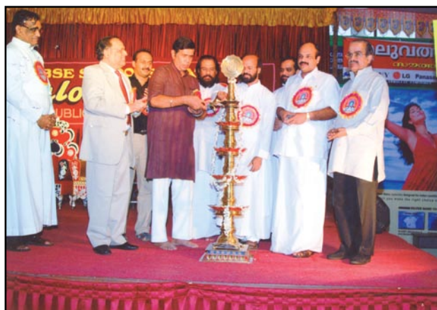
Hon'ble Union Minister for Labour & Employment Mr. Oscar Fernandes inaugurating the cultural meet on 26th October 2007 organised by the confederation of Kerala Sahodaya Schools Complex