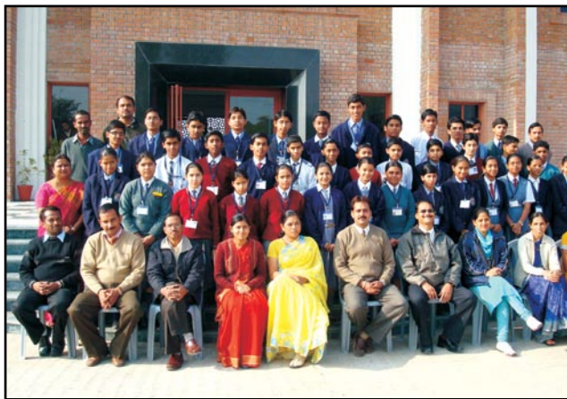
Participants with Staff at the Enrichment Camp held at Ambuja Public School, Rabriyawas

Ambuja Public School hosted an enrichment camp for the high flyers of grade X under the patronage of Ambuja Vidya Niketan Trust. The camp involved 38 participants from the Ambuja Group of Schools. The teachers of the schools selected acted as the resource persons. During the academic session, in addition to the various assessments, question hour session etc, there were special provisions for the amusement and entertainment of the students, which included a one day trip to Ajmer and Pushkar. It was hoped that such an initiative would be remarkable in enhancing the students performance level and motivation for the Board examination.