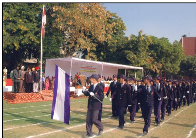
Students marching during the XII Athletic meet held the Guru Harkishan Public School, New Delhi

The CBSE cluster XII Athletic Meet 2007 was held at Guru Harkrishan Public School, Vasant Vihar from December 5, 2007 to December 8, 2007.