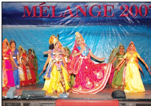
Students of Navy Childrens School, Port Blair performing 'Ras Leela' during the Annual Prize distribution function