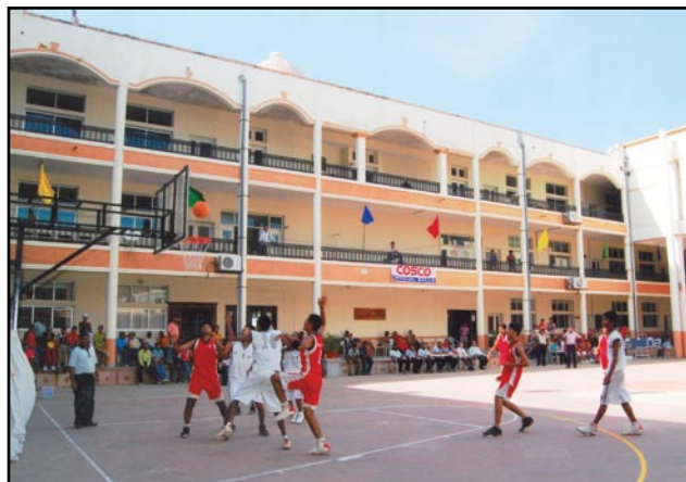
CBSE Cluster - IX Inter School, Basket Ball Tournament, held at Advanced Academy, New Delhi

XI CBSE Cluster Basket Ball Tournament with 1045 participants, constituting 93 teams from MP and Chattisgarh vied for the National championship. Matches were played by boys and girls in the under 19 category. The tournament