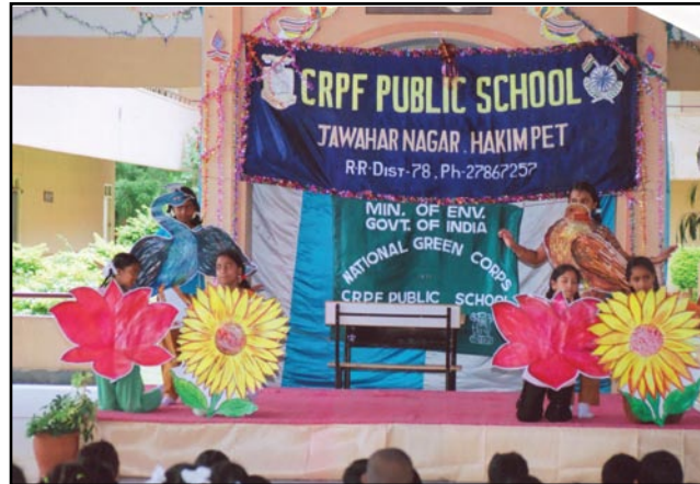
Students of CRPF Public School, Hakimpet presenting an item to highlight the importance of Vanamahotsava