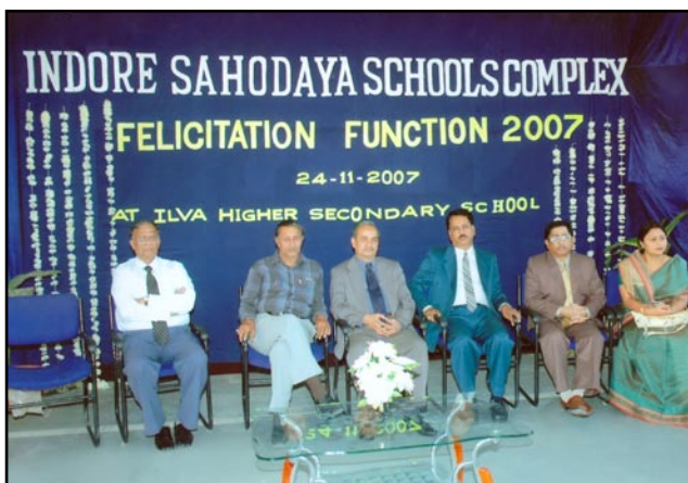
Guests present at the felicitation organised by the Indore Sahodaya

Indore Sahodaya Schools Complex organized a function to felicitate the meritorious students of classes X and XII for the session 2007 at ILVA Higher Secondary School, Indore.