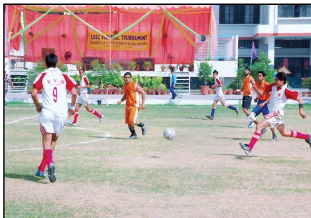
Football Tournament in progress in Ludhiana Sahodaya

Games and Sports are an integral part of curriculum. They not only provide the much needed break from the daily academic routine but are certainly an outlet for the spirit of adventure, valour and desire to excel over others. In the advent of modern technology and advancement, games provide a necessary lesson in team work & cooperation.