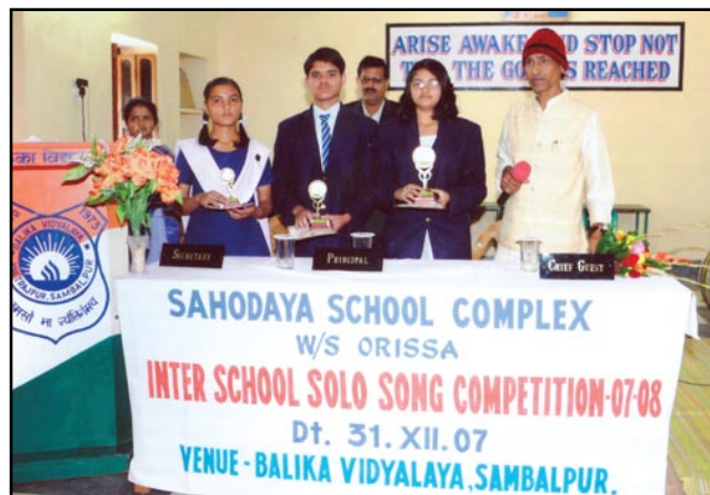
Winners of the Solo Song Competition conducted by Orissa w/s SSC

The competition was one of the memorable events for the Complexes.