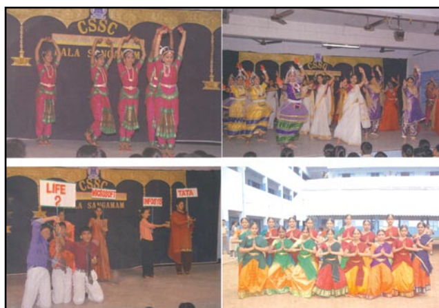
Bala Sangamam - Presentation by Students of Chennai Sahodaya

The first inter cluster cultural presentation 'Bala Sangamam' was co-ordinated and organized by the Chennai Sahodaya School Complex on 22.11.2007 at PSBB KK Nagar. The presentations made by the students of the city CBSE schools were meant to promote the spirit