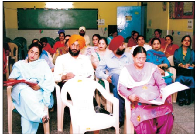
Teachers attending a seminar on teaching Punjabi Language at Guru Harkrishan Public School, Delhi

Teachers teaching the language from other public and aided schools were also invited to share the resources of their school in keeping with the neighbourhood school concept. Teachers from about 25 schools participated.