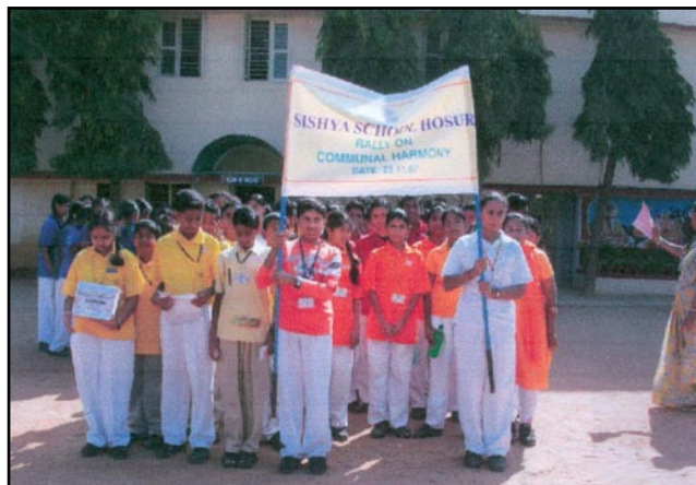
A rally organised by the students of Sishya School, Hosur as part of Communal Harmony Campaign

November 2007 to promote communal harmony and national integration. A rally was organized by the school, involving the students of standards VIII and IX who had prepared and distributed posters and pamphlets against communal clashes amongst the public. The rally ended at the Sub-Collector's office, where the students handed over the posters and pamphlets to the Sub-Collector who interacted with the students on communalism which was a threat to national integration and guided them towards communal harmony.